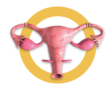
TUBAL LIGATION (getting "tubes tied")